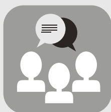
Peace dialogues & mediation