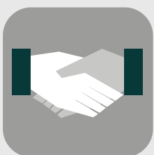
Training in conflict resolution