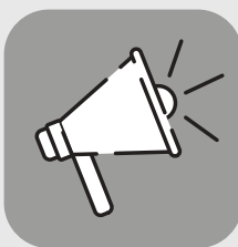
Awareness & sensitization